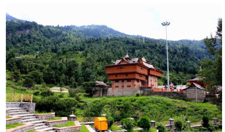
Bhimkali Temple in Sarahan