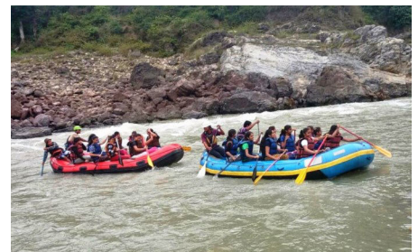
River rafting in Tattapani