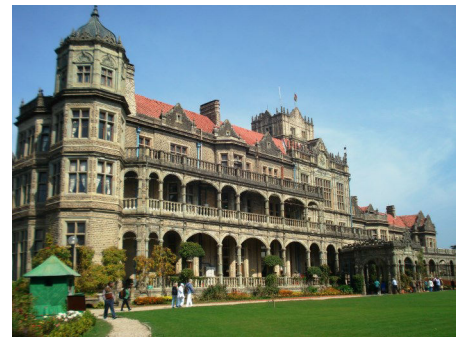
Indian Institute of Advanced Study