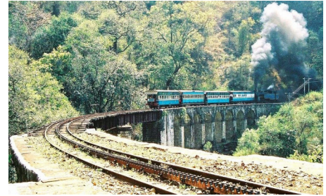
Kalka Shimla Railway

Chail (45 km), the summer capital of the former princely state of Patiala, was built by Maharaja Bhupender Singh in 1890s. It houses a cricket pitch, which is the highest in the world. Sarahan (170 km) presents a spectacular view of Srikhand range and has the majestic Bhimkali Temple .