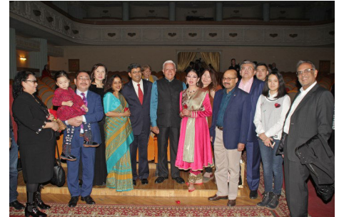
2nd Meeting of India-Kazakhstan Joint Business Council in New Delhi