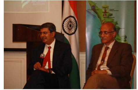
Ambassador Inaugurates a Conference "India at 7.0: History and Modernization"